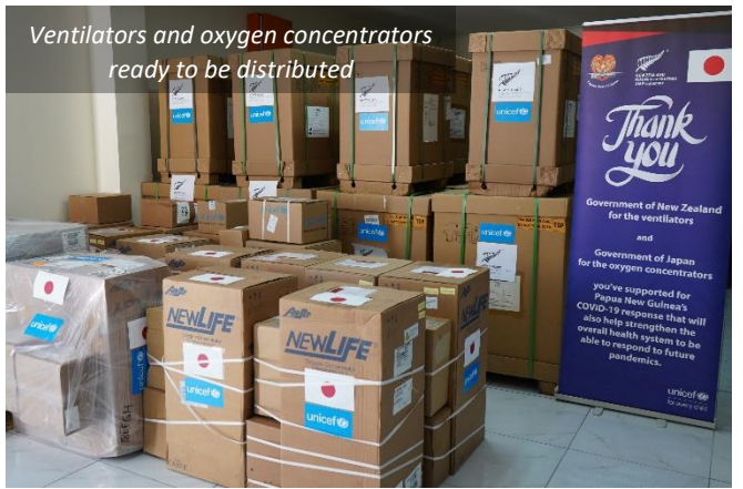
Ventilators and oxygen concentrators ready to be distributed