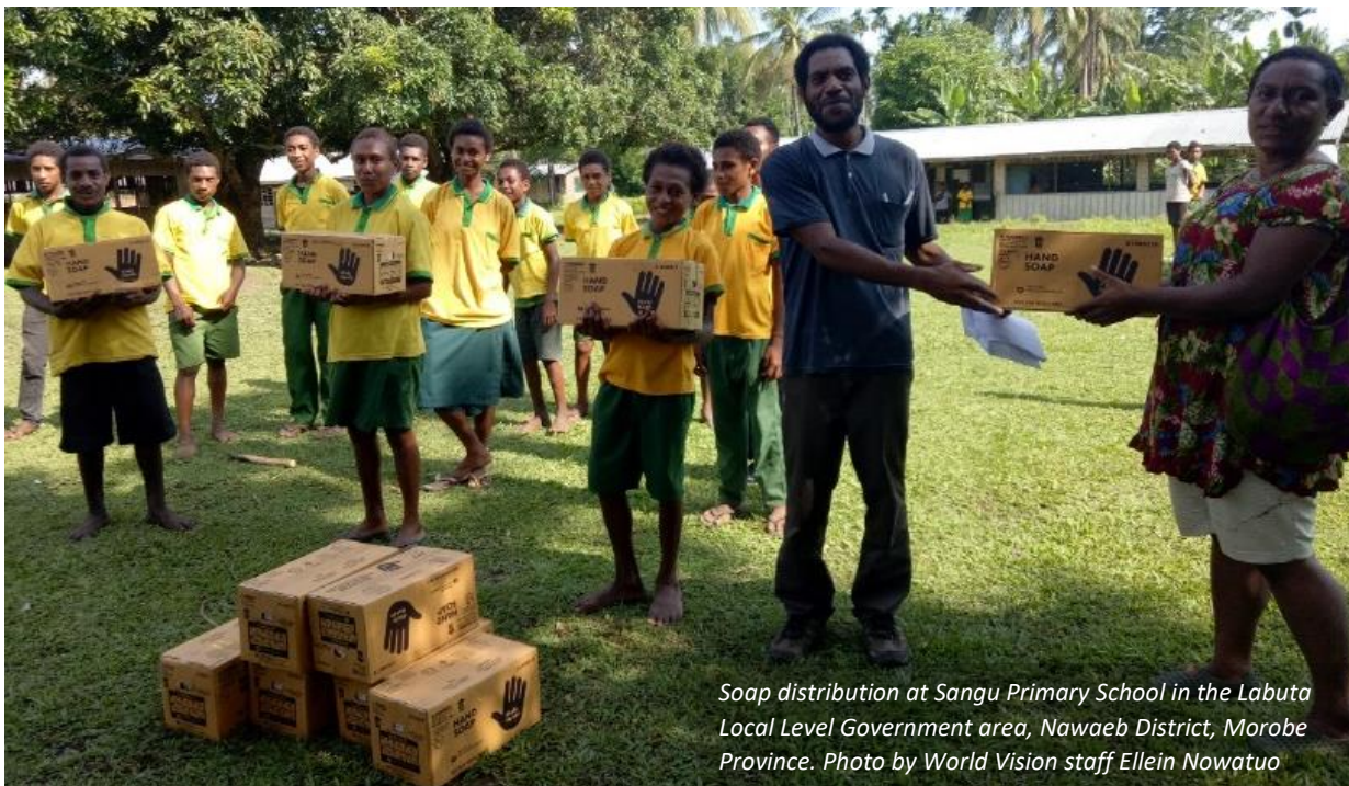
Soap distribution at Sangu Primary School in the Labuta Local Level Government area, Nawaeb District, Morobe Province.

stop the spread of COVID-19, are being distributed to 290 schools, 55 health centres and 800 communities in the five districts.