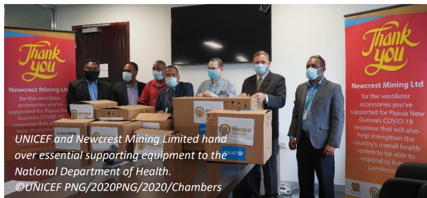
UNICEF and Newcrest Mining Limited hand over essential supporting equipment to the National Department of Health.