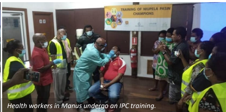
Health workers in Manus undergo an IPC training.