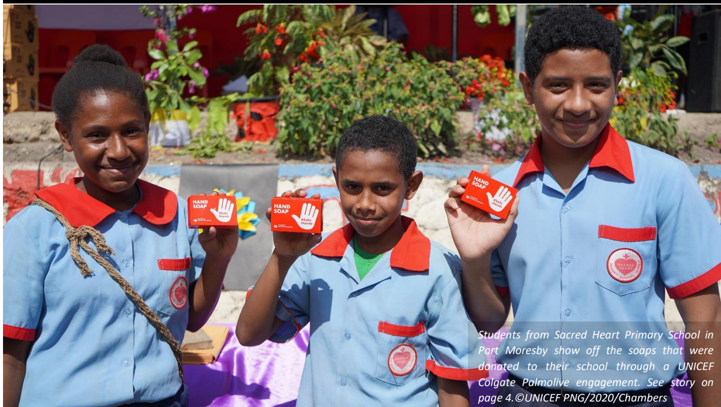
Students from Sacred Heart Primary School in Port Moresby show off the soaps that were donated to their school through a UNICEF Colgate Palmolive engagement. See story on page 4.