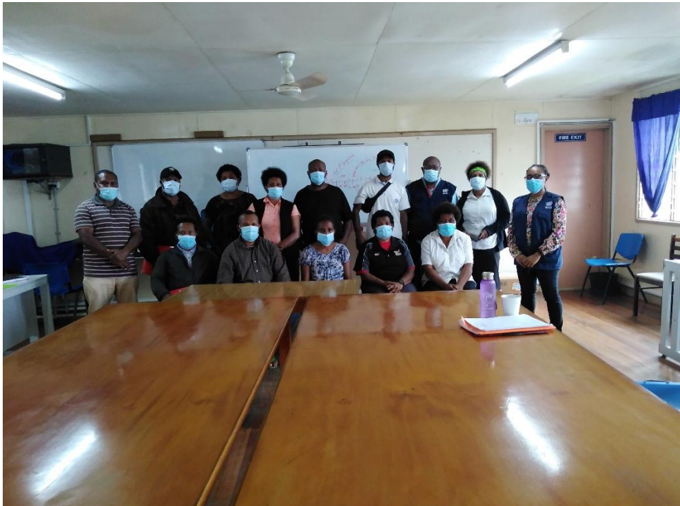
Photo 4: Antigen rapid diagnostic test (AgRDT) validation training with healthcare workers in Western Highlands Province.