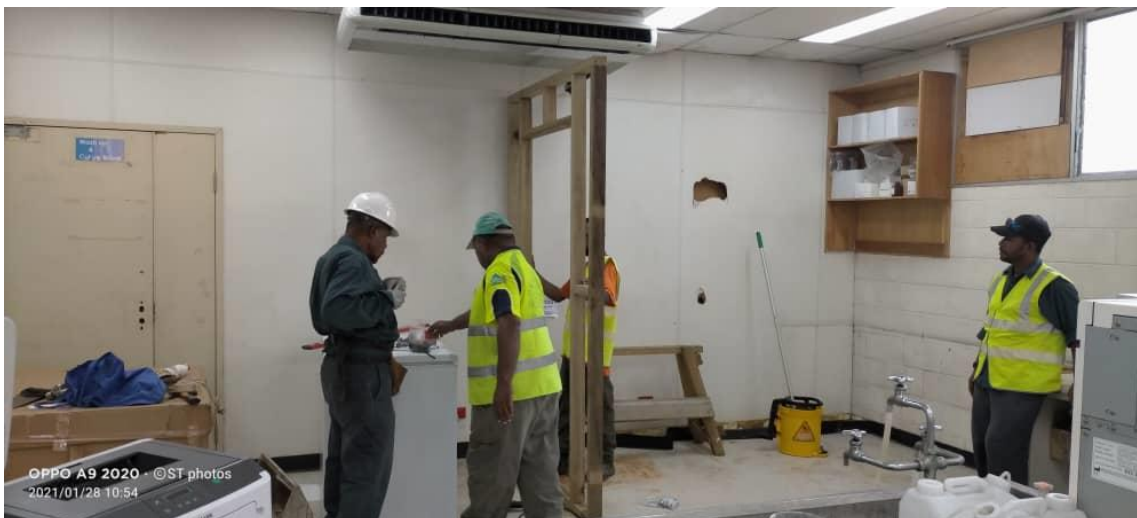
Photo 5: Construction on partition for new PCR laboratory at Angau.

----- For more information about this Situation Report, contact: