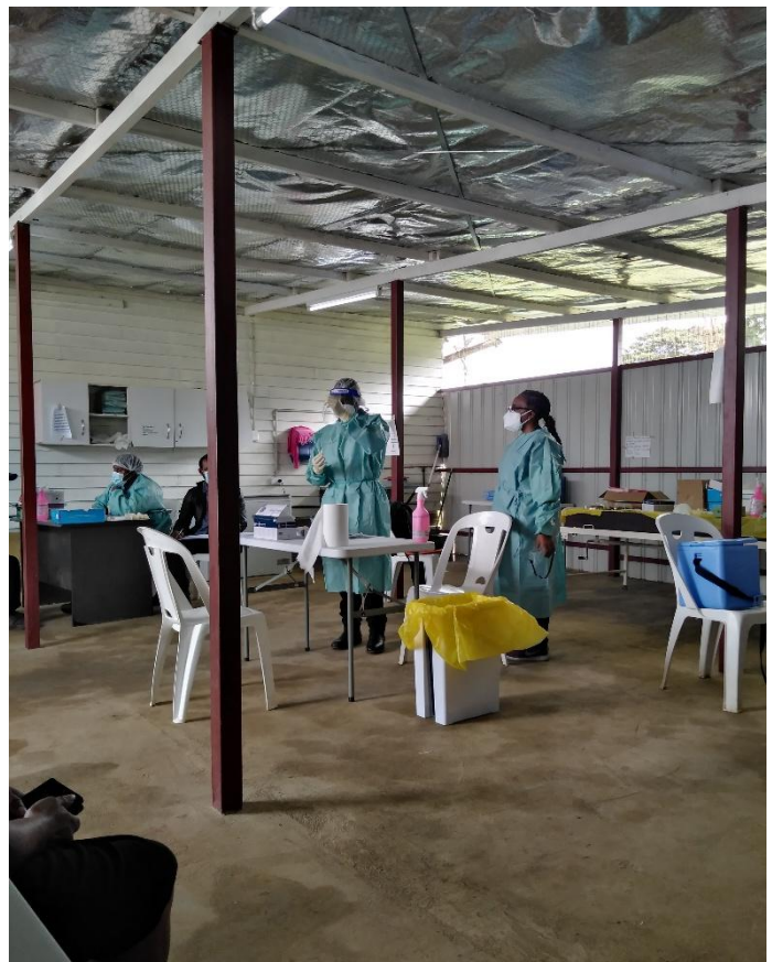
Photo 3: Antigen rapid diagnostic test (AgRDT) validation training with healthcare workers in Western Highlands Province.