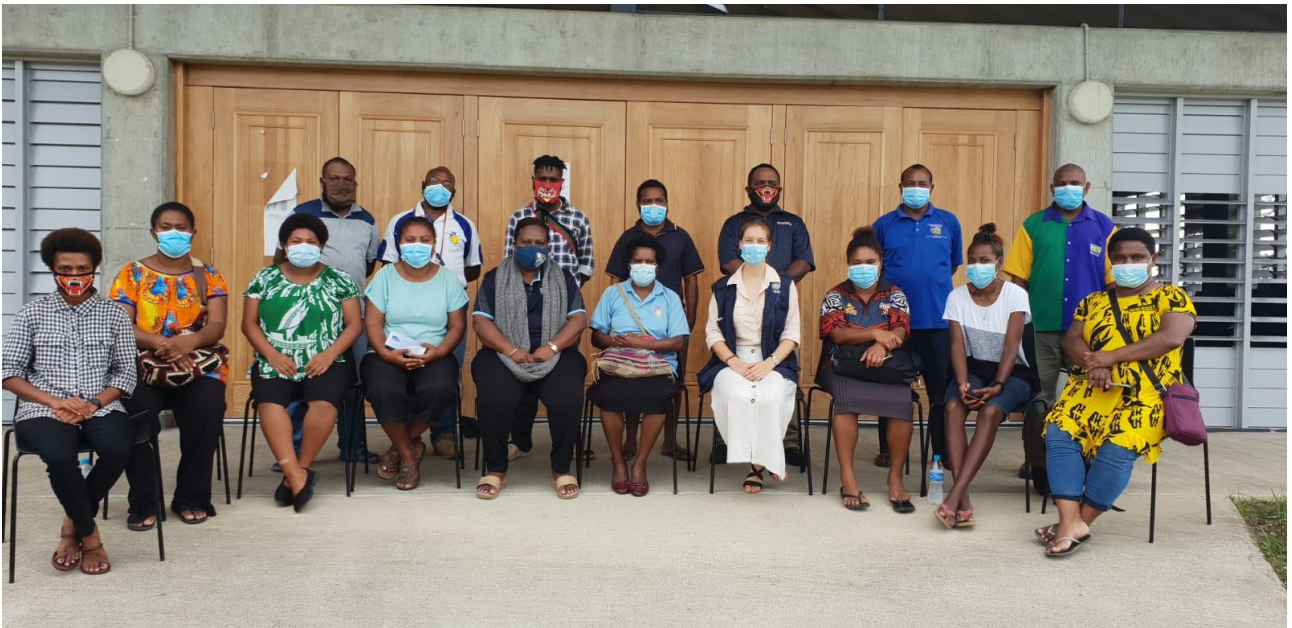
Photo 1 & 2: Antigen rapid diagnostic test (AgRDT) validation training with healthcare workers in Morobe.