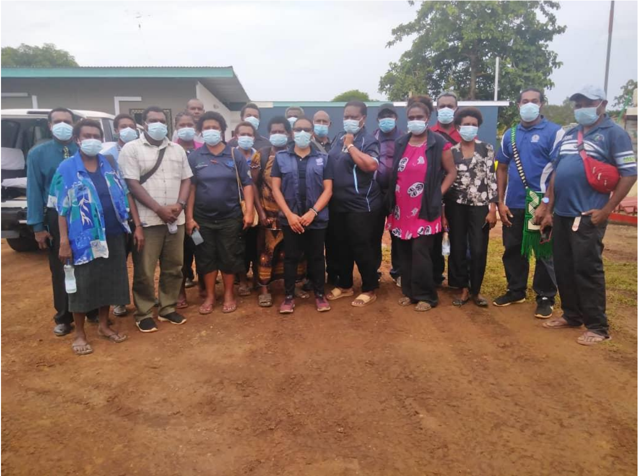
Photo 1: Antigen rapid diagnostic test (AgRDT) validation training with healthcare workers in Daru.

----- For more information about this Situation Report, contact: